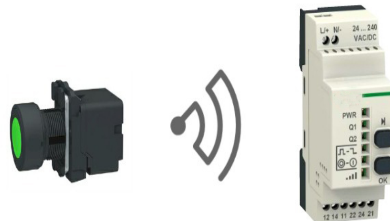
DOOR BELL - NO BATTERY – NO CABLE

Contact us today to get a quote and get rid of these messy cables!